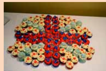
An impressive Union Jack inspired array of home made cupcakes