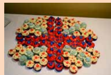
An impressive Union Jack inspired array of home made cupcakes