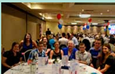
The WS NSW Annual Dinner underway at the Bankstown Sports Club