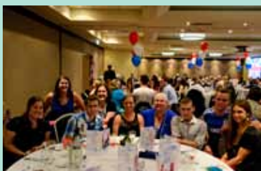
The WS NSW Annual Dinner underway at the Bankstown Sports Club