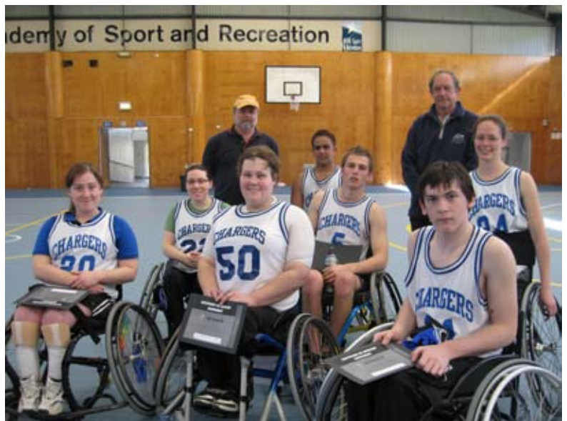
2010 Country Cup Winners, Canberra Chargers