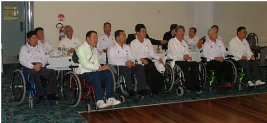
A team representing the Korean Disabled Veterans Sports Council competed at the State Championships.